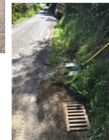
Highways Working Group model was successfully piloted at Exmoor LCN