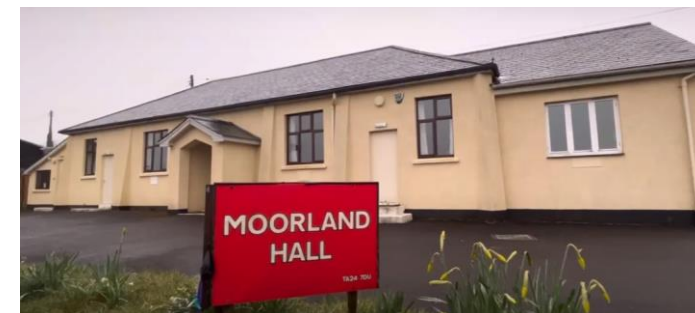
LCN venue: The Moorland Hall, Wheddon Cross