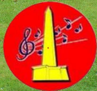
Wellington Silver Band